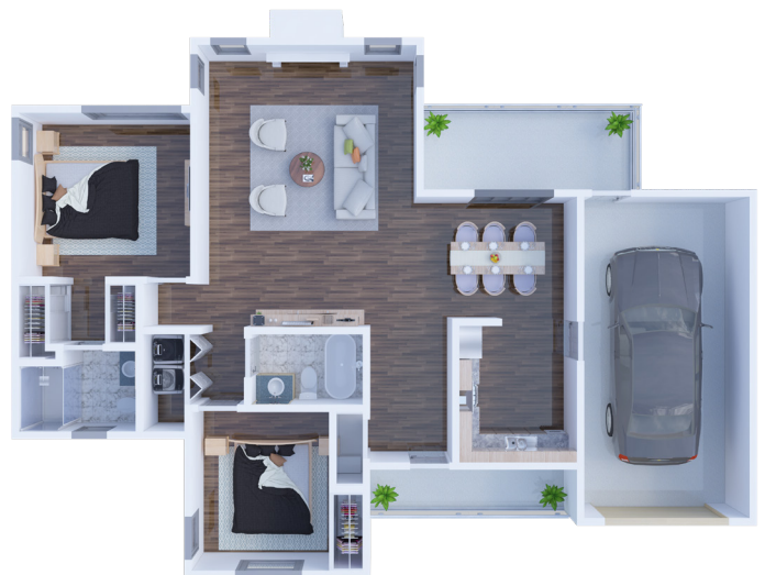
Cottage Two Bedroom 1,242 SQ FT

Solstice Senior Living at Bakersfield 8200 Westwold Drive, Bakersfield, CA 93311 (855) 224-2416 SolsticeSeniorLivingBakersfield.com