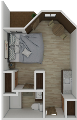
A5 Studio 391 SQ FT