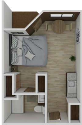
A1 Studio 398 SQ FT

Solstice Senior Living at Bakersfield offers several floor plan choices to suit your needs.