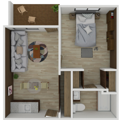
B1 One Bedroom 545 SQ FT