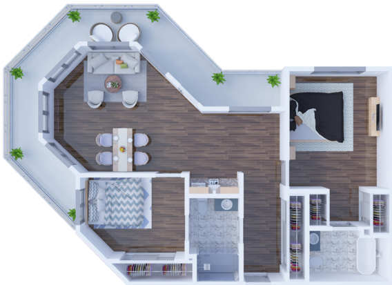
C1 Two Bedroom 901 SQ FT