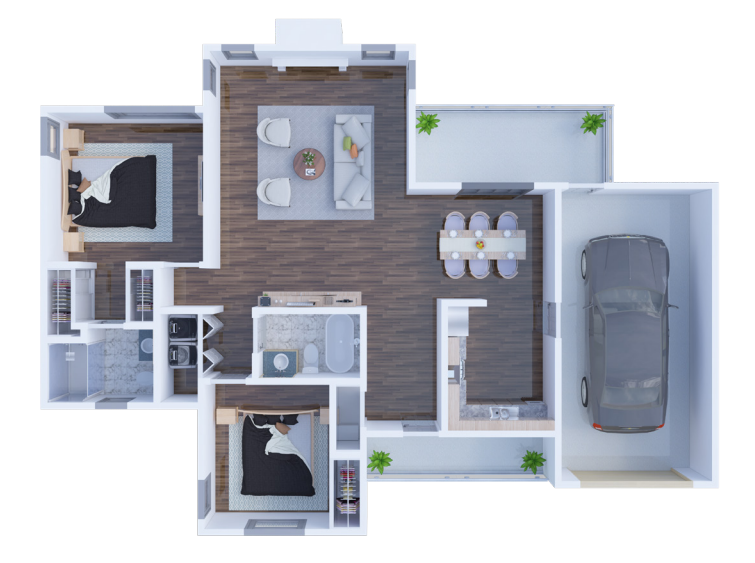
Cottage Two Bedroom 1,242 SQ FT