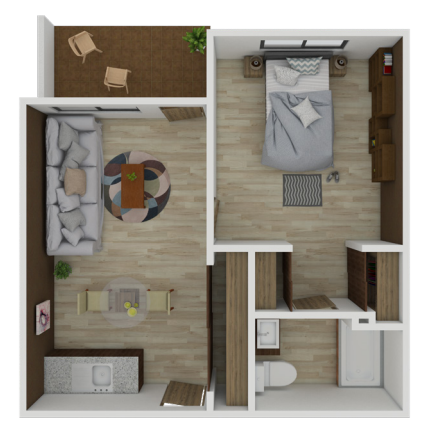
B1 One Bedroom 545 SQ FT