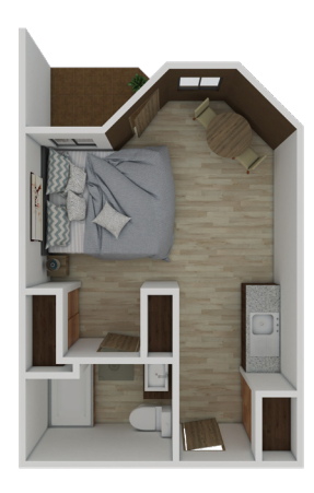
A5 Studio 391 SQ FT