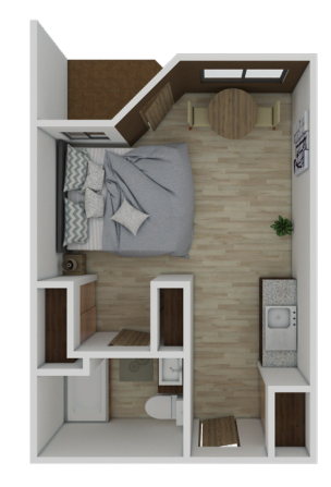
Al Studio 398 SQ FT

Solstice Senior Living at Bakersfield offers several floor plan choices to suit your needs.