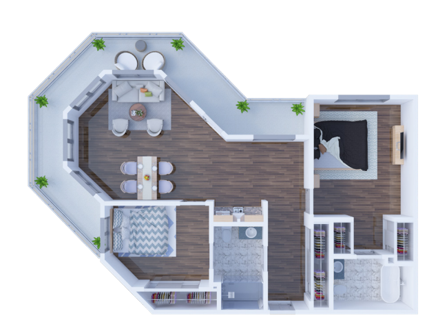
C1 Two Bedroom 901 SQ FT